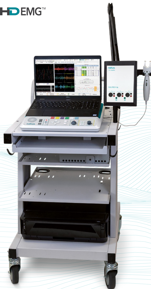
Includes electrical stimulator probe