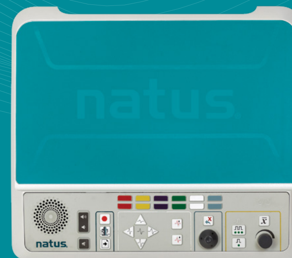
User-friendly, color-coded controls